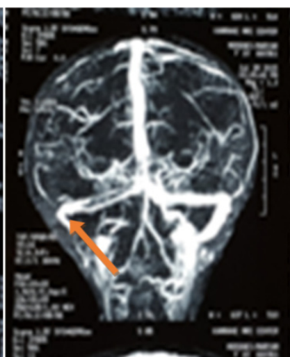
Fig. 2. Hypoplasia of (A) right transverse and (B) sigmoid sinuses