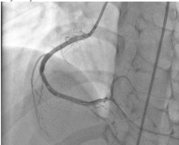
Fig. 4. Stent implantation revealed stenosis of right coronary artery.

at extremely high risk for early myocardial infarction, which has been documented as early as 2 years of age and require very aggressive therapy. CT angiography is helpful for surveillance of the coronary atherosclerosis (8). Kaylkcloglu M, et al reported 17 (11 female, 6 male) HoFH Turkish patients between the years 2000-2013. Parents of 65% of patients had consanguineous marriage. The frequencies of presentations were as follow: xanthoma 59%, aortic valve pathology 59%, and coronary artery disease 59%, and carotid artery plaques 47%. They concluded that progressive atherosclerosis and aortic stenosis are due to delayed treatment with lipid apheresis (9). Parents of our case had consanguineous marriage and xanthoma was early clinical presentation followed by cardiovascular complications.