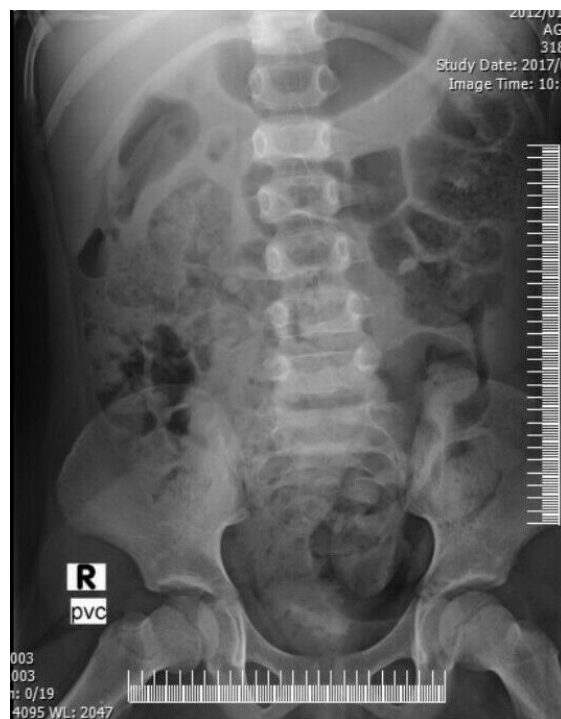
Fig. 1. CT scan

Renal abscesses occur in all ages and are three times more common in males than in females. These abscesses are walled-off cavities and most of them are unilateral single lesions (77%) and occur in the right kidney more frequently (63%). The incidence of renal abscess in children is unknown (4). Interestingly our patient was female with multiple renal abscesses in her left kidney. Diagnosis of renal abscess is a clinical challenge due to diversity of the source of infection and different pathogenic mechanisms, such as complication of UTI, hematogenous spread of a far infectious foci, or in rare cases of staphylococcal carbuncle proximal kidneys (5,6). Our case had pyuria with negative urine and blood culture. The clinical diagnosis of renal or perinephric abscess should be suspected in a patient with inconsistent signs and symptoms, including prolonged fever